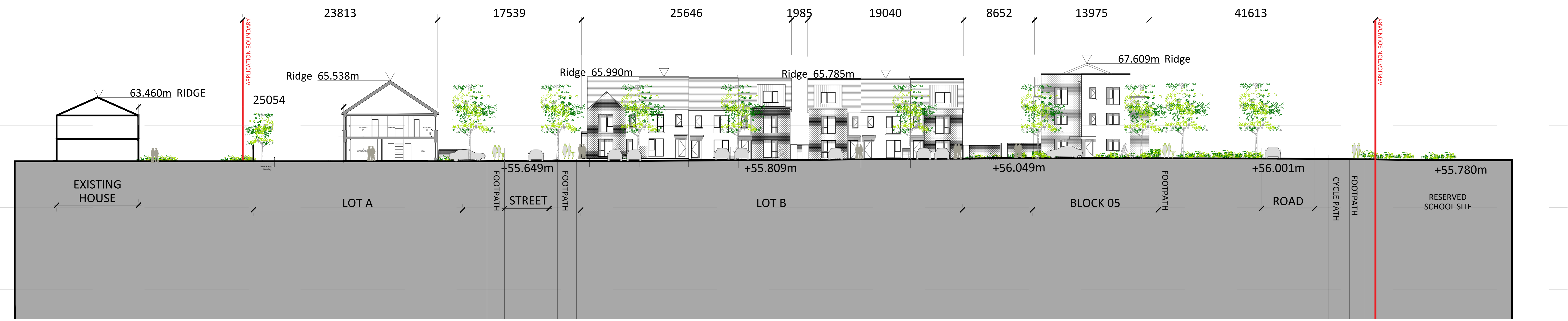
SECTION H-H: 1:200